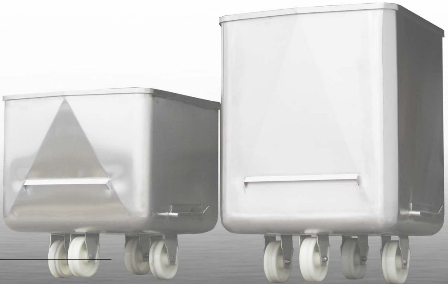
400 lb Euro-Style Buggies Stainless steel