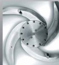
Four Fold Blade