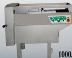
1000, 1150, 1300