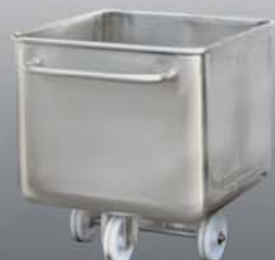
400 lb SS Buggy