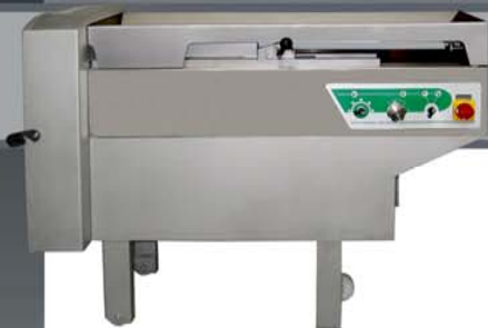
Pro-Dice 1000, 1150, 1300