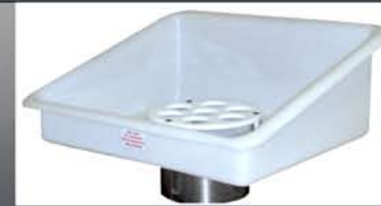
PLASTIC COVERED FEED TRAY