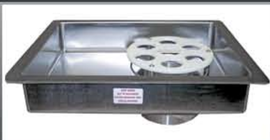
LOW PROFILE STAINLESS STEEL FEED TRAY