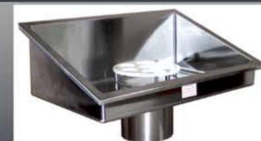
STAINLESS STEEL COVERED FEED TRAY