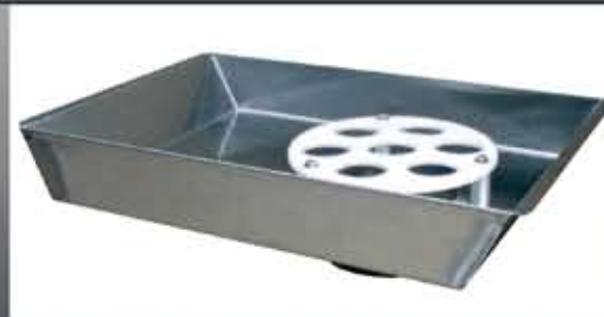
STAINLESS FEED PAN