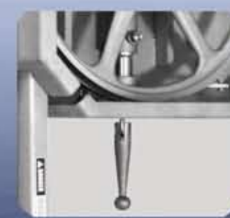
Lower Tension Handle