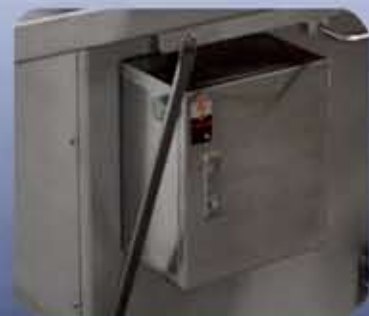
NEMA IV Control Box