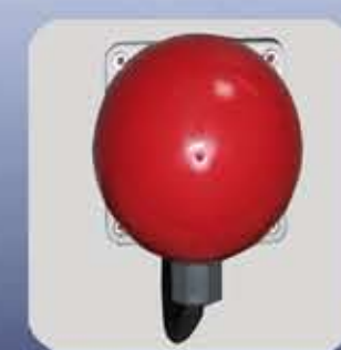
Emergency Foot Switch