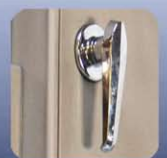
Magnetic Safety Switches