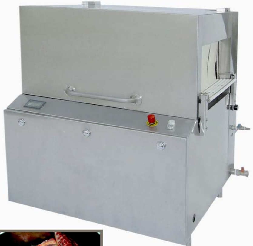
VFST-700 & VFST-1000