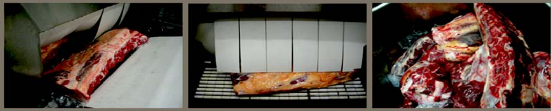
VFST -10, VFST-700, VFST-1000 HOT WATER SHRINK DIP TANKS

DESIGNED TO OUTPERFORM TRADITIONAL PACKAGING MACHINES!