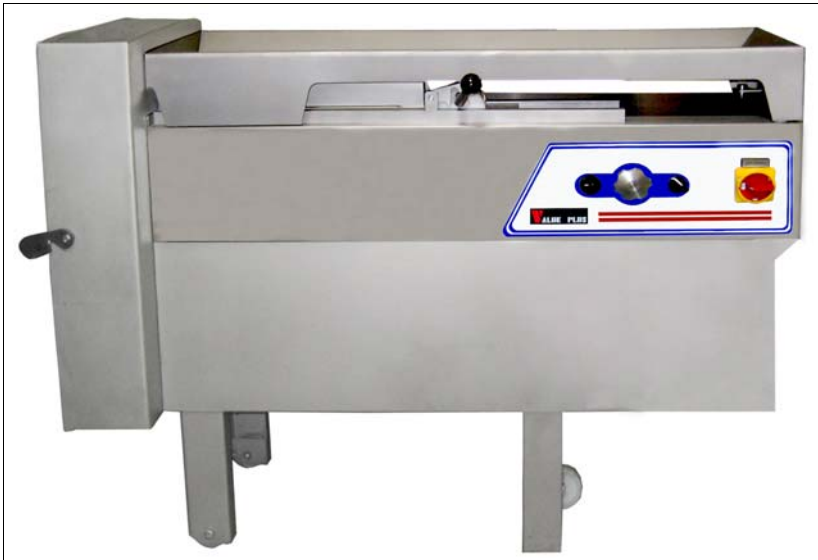
Dicer: MD-1000 Automatic Dicer