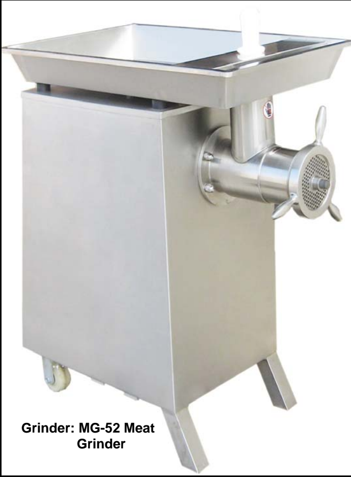
Grinder: MG-52 Meat Grinder