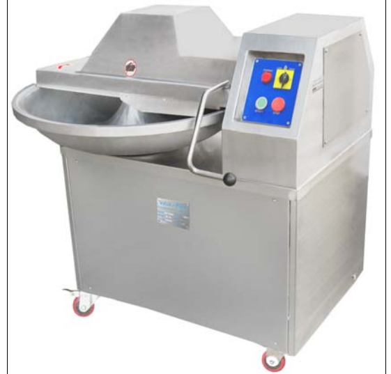
Bowl Cutter: BC-20, BC-25, BC-50