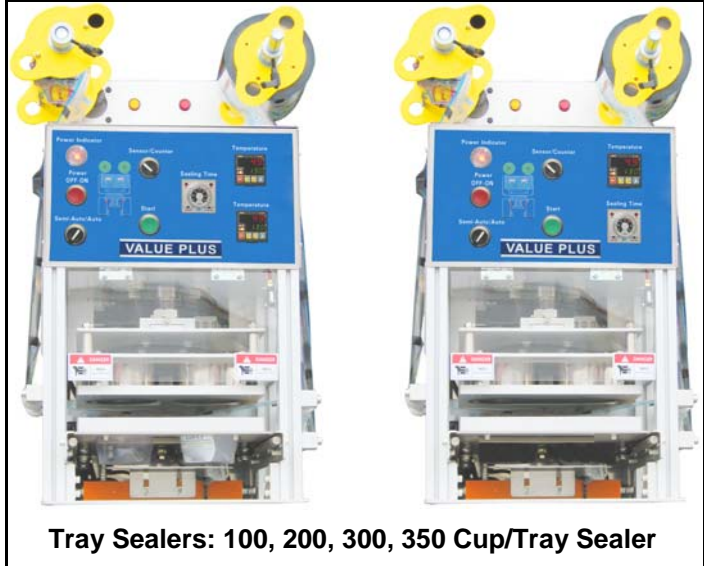
Tray Sealers: 100, 200, 300, 350 Cup/Tray Sealer