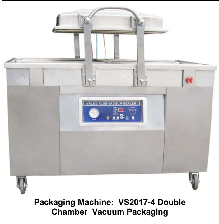
Packaging Machine: VS2017-4 Double Chamber Vacuum Packaging