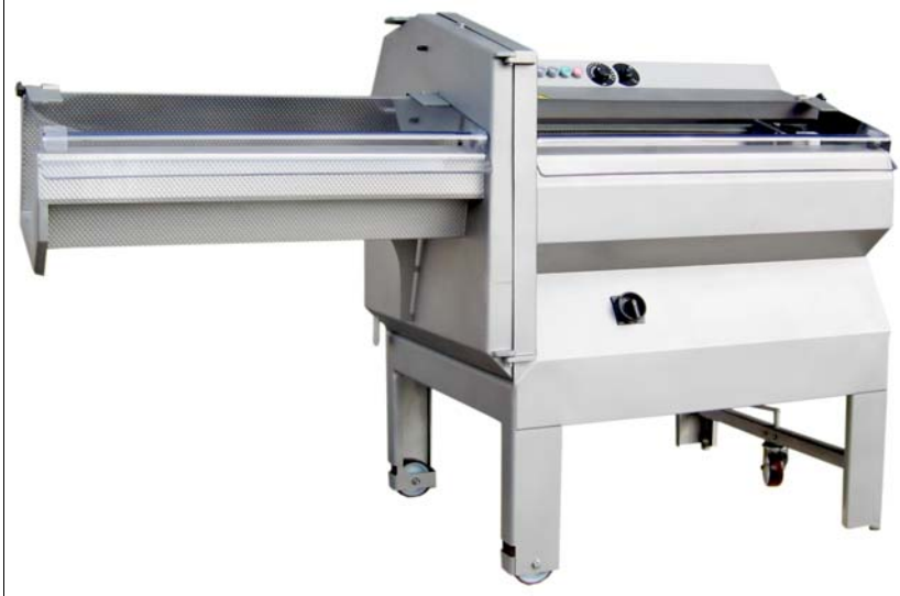
Slicer: 210 Portion Cutter