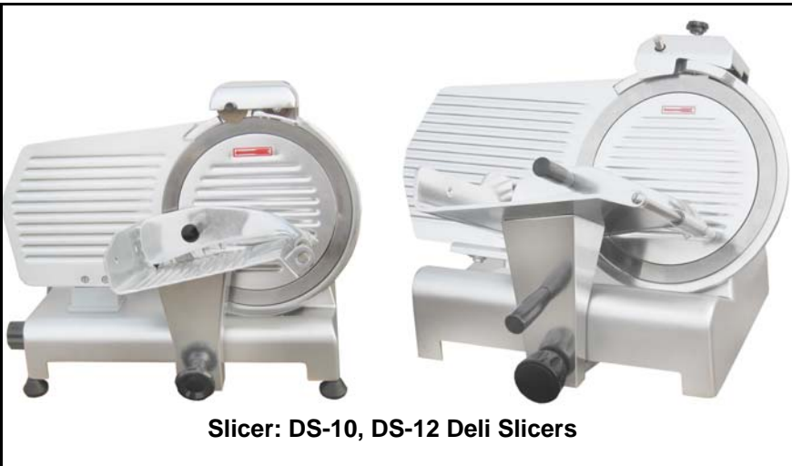
Slicer: DS-10, DS-12 Deli Slicers