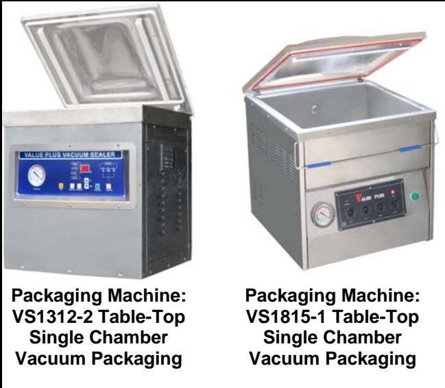
Packaging Machine: VS1312-2 Table-Top Single Chamber Vacuum Packaging