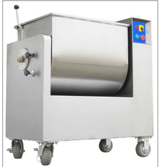
Mixers: MM-100, MM-140, MM-200, MM-300