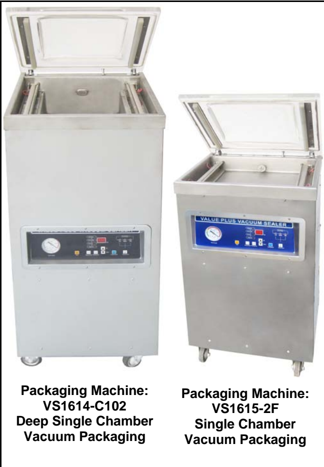
Packaging Machine: VS1614-C102 Deep Single Chamber Vacuum Packaging